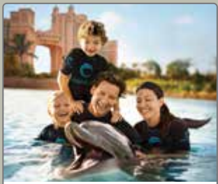
NASSAU, BAHAMAS ATLANTIS PARADISE ISLAND RESORT Jan. 29-Feb. 1, 2026