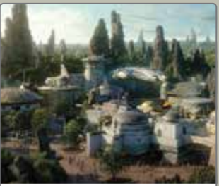
WALT DISNEY WORLD® RESORT, FL DISNEY'S GRAND FLORIDIAN RESORT & SPA March 13-15, 2026