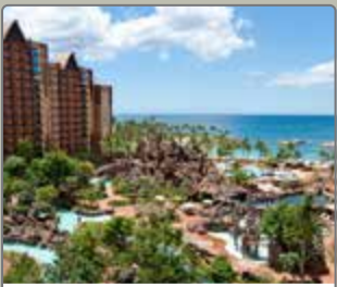
KO OLINA, OAHU, HI AULANI, A DISNEY RESORT & SPA March 8-12, 2026